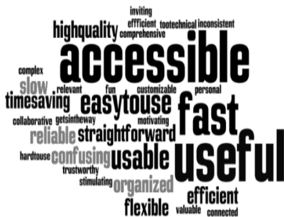
Figure 3. Desirability Tag Cloud.

words that formed the basis for a sorting exercise. Since there is a bias to give positive feedback in the university relationships already established, we made sure that at least 40% of the set consisted of negative words and phrases and tried to make the set cover a wide variety of dimensions. Each word was placed on a tag and the set was given to the students at the end of the project in full anonymity. All participating students answered this evaluation test. Each student was asked to pick the words that best describe their "experience in participating in the project", then to rank them on a scale of one to five (with one being the most precise descriptor). This method presents results as a means of visualizing the frequency of use, but with an extra dimension not found in most tag clouds: the use of light gray marks the words which were most often used negatively, as those least appropriate to describe the tools, from the five most used.