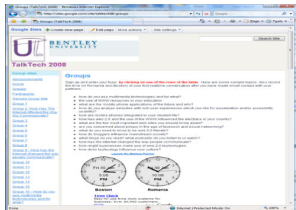
Figure 1. TalkTech 2008. Students used the "groups" page to select topics and sign up for project groups.